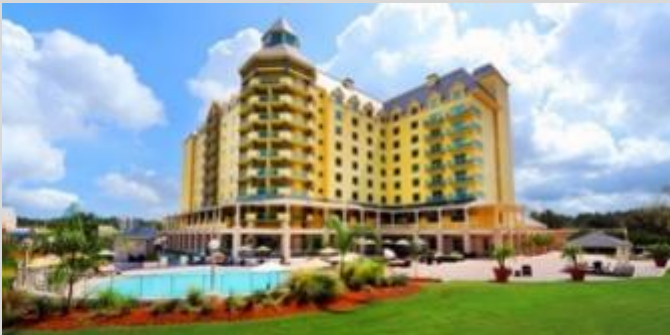
The Renaissance Resort, host hotel for the 2020 SCV National Reunion (World Golf Village, 500 S. Legacy Park, St. Augustine, Florida 32092).

2020 SCV National Reunion The 125th National Reunion of the Sons of Confederate Veterans will be held July 15-18, 2020, near historic St. Augustine, Florida.